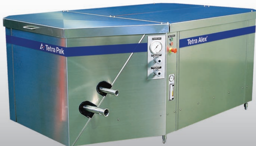
Tetra Alex 25 as homogenizer. The machine is equipped with optional equipment.

Homogenizer or high-pressure pump for liquid food applications