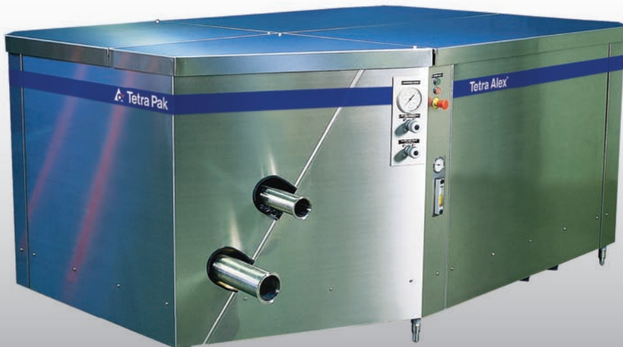
Tetra Alex 30 as homogenizer. The machine is equipped with optional equipment.

Homogenizer or high-pressure pump for liquid food applications