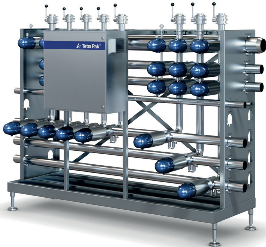
Valve Cluster for CIP