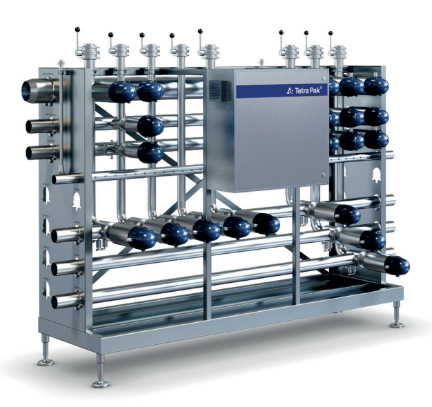
Valve cluster for CIP

Available in different sizes depending on capacity. All parts in contact with the product are made of AISI 316L.