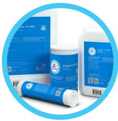
Tetra Pak® Food Grade Lubricants

An extensive portfolio available for the food and beverage industry: