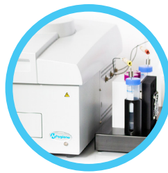
Rapid microbial detection