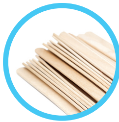
Wooden sticks for ice cream