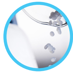
Tetra Pak® Hot Melt Adhesives