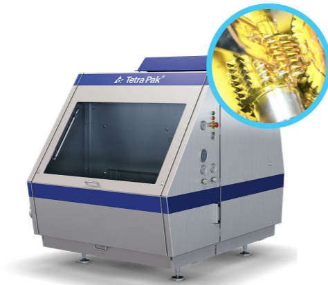
Tetra Pak® Homogenizer

By changing from mineral oil to Tetra Pak® Food Grade Oil, the normal oil change at 6000 hours could be extended to 12000 hours. This means you spend less time, use less lubricants, and reduce costs at the same time.